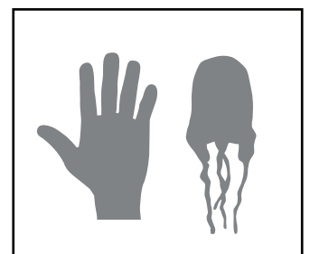
Size relative to human